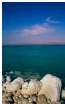
Salt coated rocks on the coast of the Dead Sea, Israel